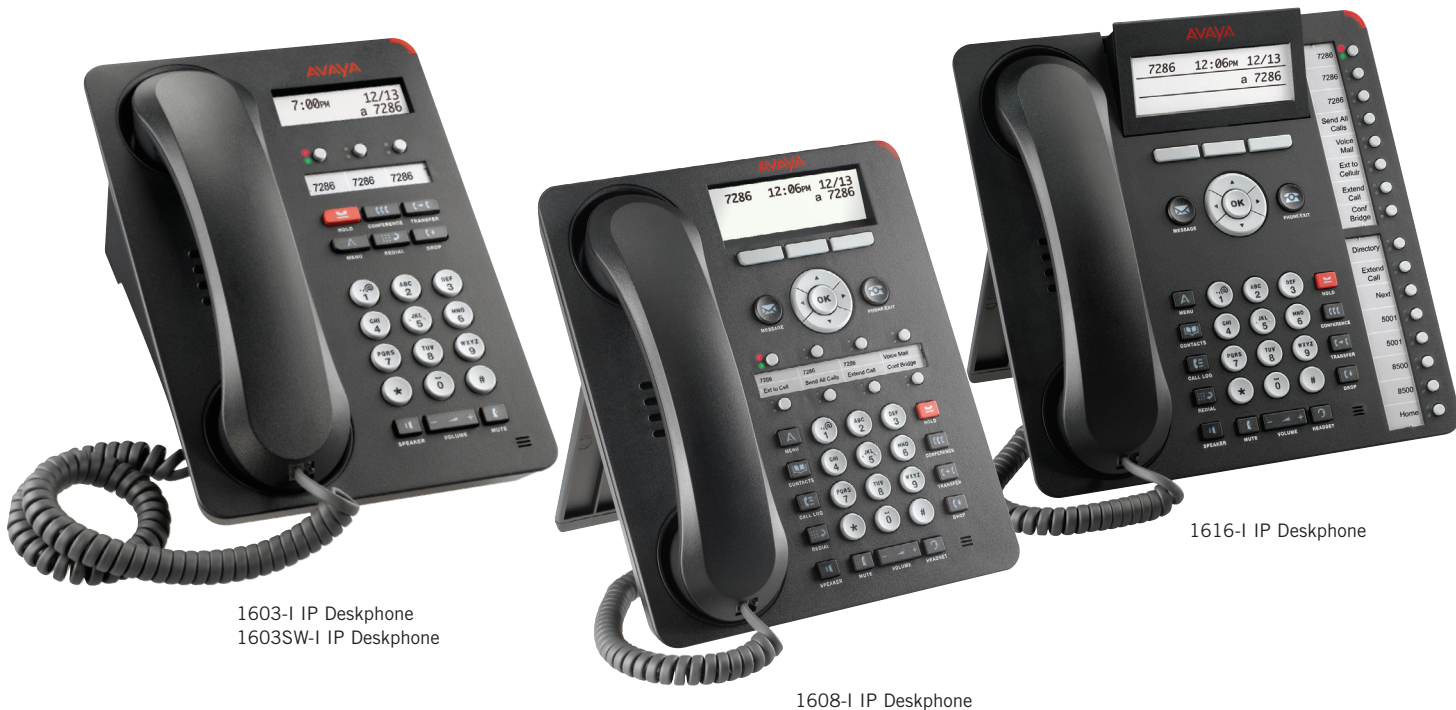
1603-I IP Deskphone 1603SW-I IP Deskphone